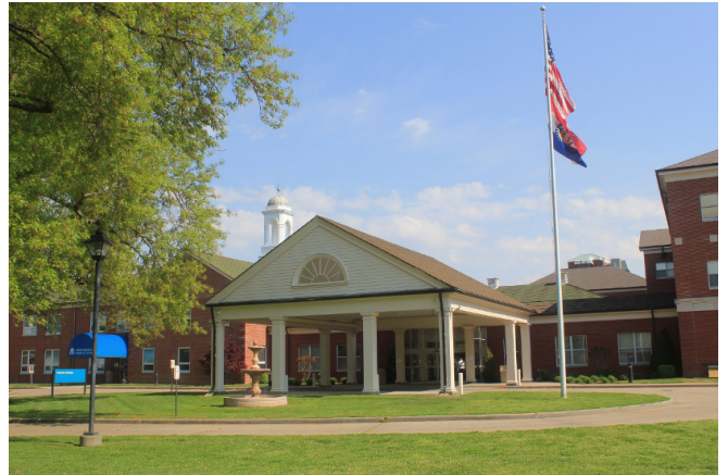
Missouri Delta Medical Center