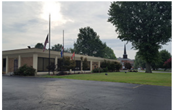
Ferguson Medical Group