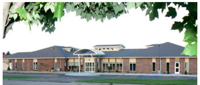
Katy Trail Community Health