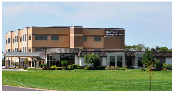
Bothwell Healing Arts Center

Federally Qualified Health Center Patients Served in 2017 (5 locations): 17,152 Employees: 120 Pediatric Patients: 53%