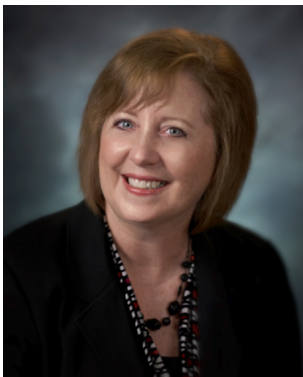
Beth Everts Local Hospital Contact