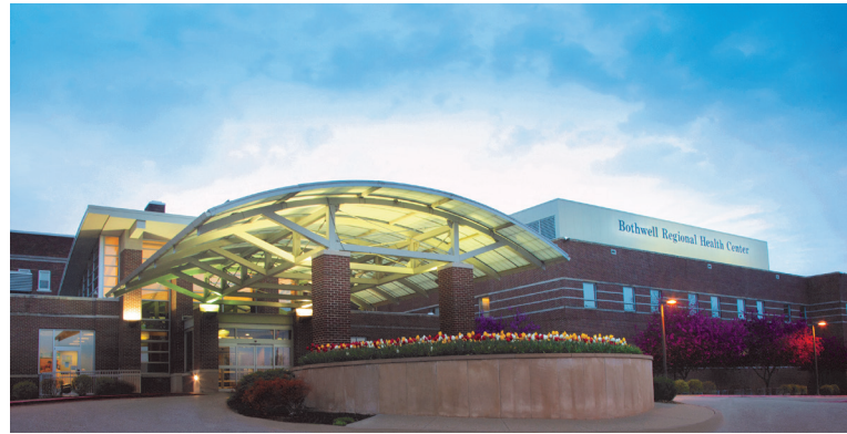
Bothwell Regional Health Center

Total Staffed Beds: 108 Total Patient Revenue: $315,039,991 Surgical Procedures Per Year: 3,377 Medicare Patients: 55% Medicaid Patients: 13% Pediatric Admissions Per Year: 78 Annual ER Patients: 24,424 Average Deliveries Per Year: 470 Over 20 Outpatient Clinics