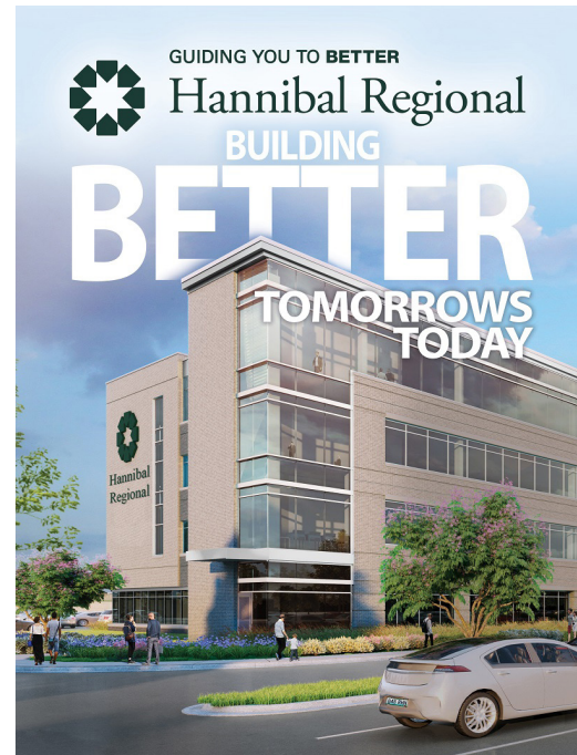
Hannibal Regional Hospital